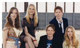
BROTHER & SISTER PIANISTS