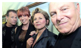
LEGENDARY SINGER TIM HAUSER OF MANHATTAN TRANSFER DIES